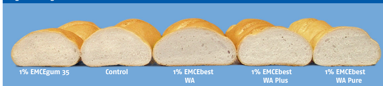
Fig. 2: Baking trials with white hearth bread

The texture of the bread was even, and the elasticity of the loaves after three days was similar when measured with the Texture Analyzer.