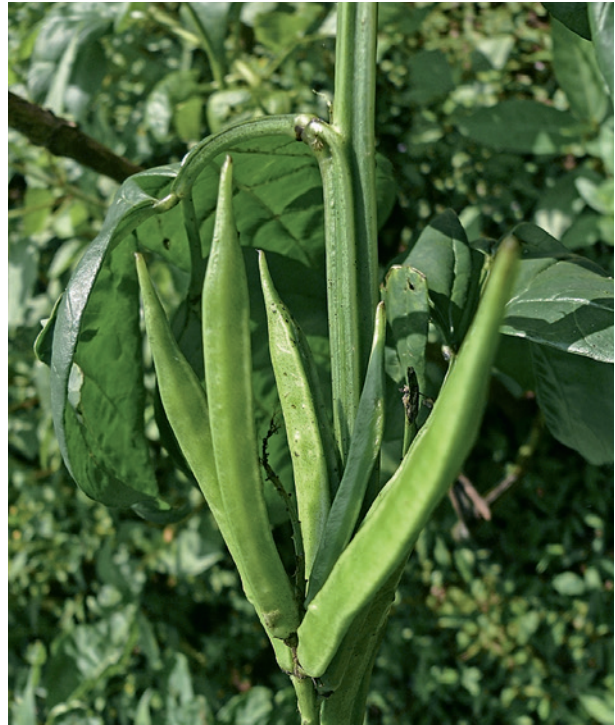
The guar bean

Moreover, besides a nearly 8% higher water absorption the farinogram showed the flour treated with EMCEbest WA to have very good stability (Fig. 1).